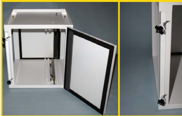
Top: 1 high by 3 wide in standard 14 gauge galvanized steel. Left: Crank filter sealing action ensures that system efficiency will be equal to the filters' efficiency. Doors may swing on a hinge or are completely removable. Right: UV resistant sealing knobs ensure a tight seal each time the access doors are removed for filter service. Lower photos show optional pastel white finish specific to medical facility applications.

Side-access housing with 2" prefilter track and crank-type sealing mechanism for HEPA/ULPA installation.