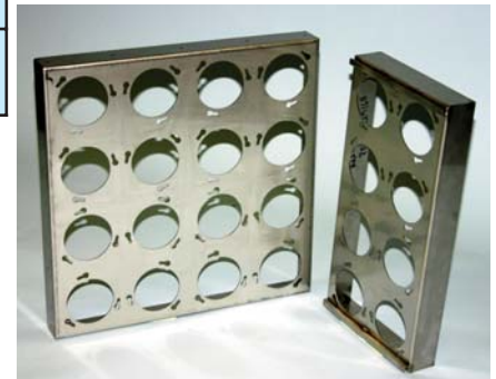
Camsorb canisters are designed to attach to Camfil Farr Camsorb holding frames. Built-up bank and side-access housing versions are available. See product sheets 2117 and 2118 respectively. Above shows a 24" x 24" and a 12" x 24" frame.