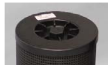
Camfil Farr Canisters remove easily with a 24mm wrench (plastic) or a Camfil Farr canister removal tool (steel).

Canisters are also available in stainless steel. Stainless steel canisters are factory rechargeable/refillable. Please contact factory for assistance in selecting the optimum sorbent for your application. Camsorb canisters should be prefiltered by particulate filters with a minimum of MERV 9 per ASHRAE Standard 52.2. A MERV 6 filter may be used downstream to control sorbent dusting (if required). Operating temperature limitations 105° F (41° C) for plastic and 140° F (60° C) for stainless steel. Not for installation in condensing environments or when entrained moisture is present. Camsorb cylindrical sorbent canisters are also known by the trade name of Camcarb (in Europe). For sound attenuation data request Test Report 1/1999, Institute for Acoustics, available from Camfil Farr.