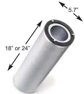
Optional stainless steel model shown.